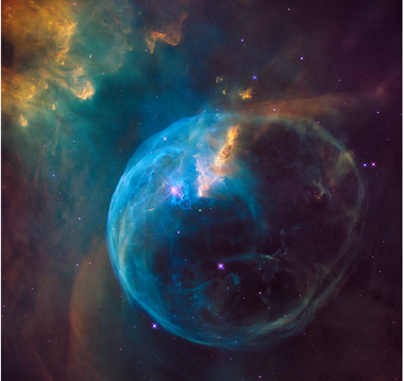
of the Bubble Nebula as imaged 229 years after its discovery by William Herschel.